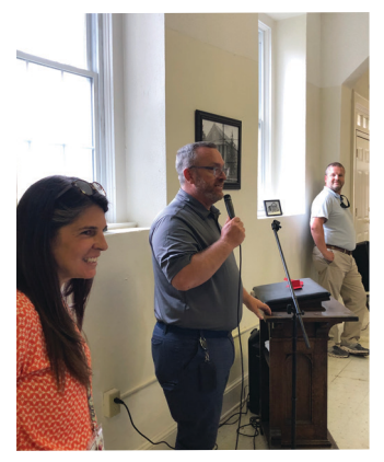
Area school leaders give presentations during a back to school workshop.

For many years, CCC has partnered with the schools in our service area to offer back to school workshops for our client parents and children. School principals and guidance counselors share with our families and answer questions about bus routes, school feeding programs, attendance and scheduling. This program allows our families to begin school with all the information needed to get the year off to a great start.